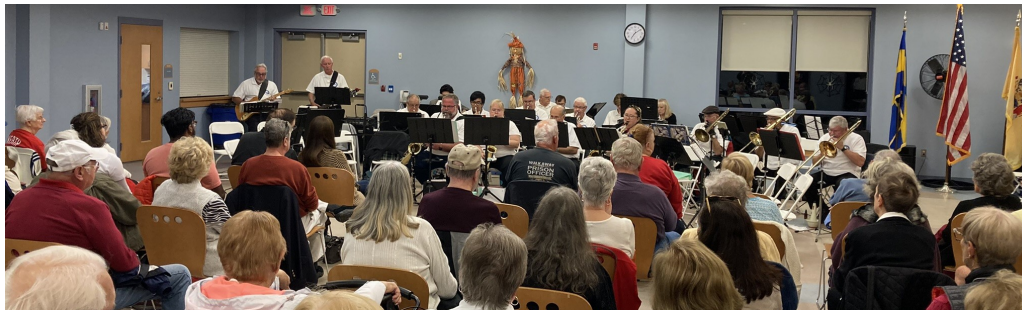
Ocean City Library Fall Concert Series, Oct. 21st, - Rowan College SJ- Cumberland Campus Jazz Band and Wind Symphony