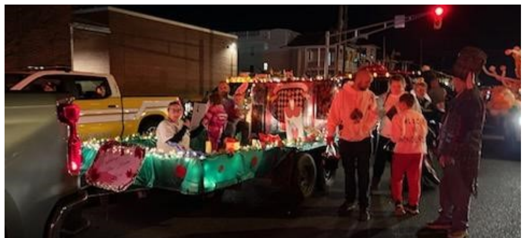
OCUT Rotary Float - Ocean City 2022 Halloween Parade (See Page 3)

November is Rotary "Rotary Foundation" Month