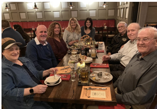
The Rotary Club of Ocean City - Upper Township "Mixer" on Thursday, Oct. 13, 2022 was an evening of social fellowship for members and guests at the Deauville Inn, Strathmere. ##